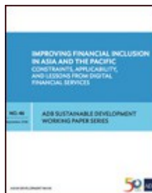
Improving Financial Inclusion In Asia and the Pacific