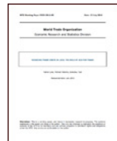
Reducing Trade Costs in LDCs: The Role of Aid for Trade

See more publications on regional cooperation in South Asia and other regions at http://www.sasec.asia/publications.php