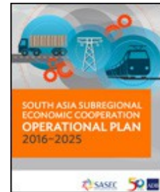
South Asia Subregional Economic Cooperation Operational Plan 2016-2025