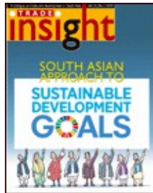
South Asian Approach to Sustainable Development Goals