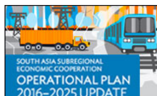
SASEC OPERATIONAL PLAN 2016-2025 UPDATE