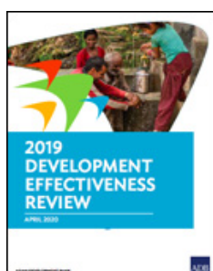
2019 Development Effectiveness Review