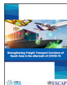
Strengthening Freight Transport Corridors of South Asia in the aftermath of COVID-19