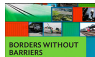
BORDERS WITHOUT BARRIERS: FACILITATING TRADE IN SASEC COUNTRIES