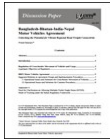
BBIN MVA: Unlocking the Potential for Vibrant Regional Road Freight Connectivity