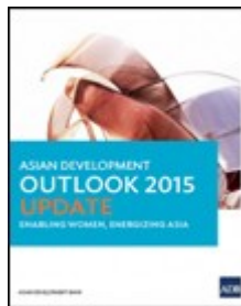
Asian Development Outlook 2015 Update: Enabling Women, Energizing Asia