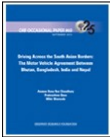
Driving Across the South Asian Borders: The MVA between Bhutan, Bangladesh, India and Nepal