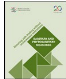
Sanitary and Phytosanitary Measures: Ensuring Safe Trading Without Unnecessary Restrictions