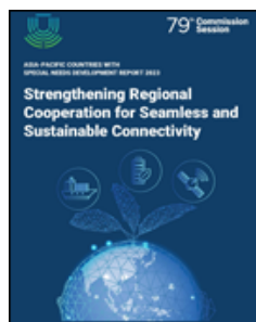
Strengthening Regional Cooperation for Seamless and Sustainable Connectivity