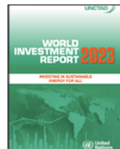
World Investment Report 2023