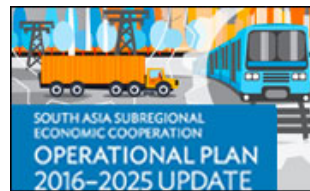
SASEC OPERATIONAL PLAN 2016-2025 UPDATE