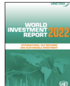
World Investment Report 2022