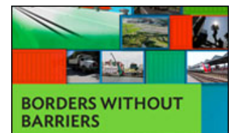
BORDERS WITHOUT BARRIERS: FACILITATING TRADE IN SASEC COUNTRIES