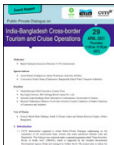
India-Bangladesh Cross-Border Tourism and Cruise Operations