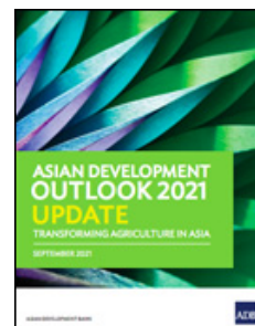
Asian Development Outlook 2021 Update