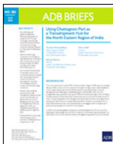
Using Chattogram Port as a Transshipment Hub for the North Eastern Region of India