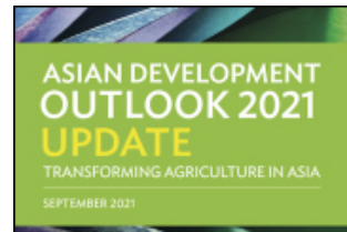
PUBLICATIONS ASIAN DEVELOPMENT OUTLOOK 2021 UPDATE