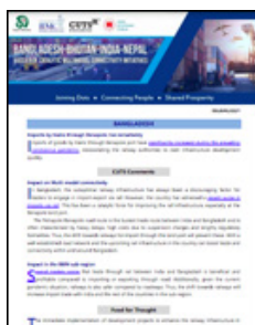
Quarterly Dossier: Catalytic Multi-modal Connectivity Initiatives in the BBIN Sub-region