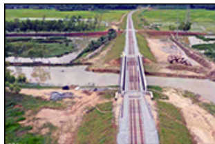
SASEC PROJECTS SASEC RAILWAY PROJECT IN BANGLADESH 62% COMPLETED