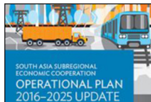
SASEC OPERATIONAL PLAN 2016-2025 UPDATE