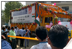
SASEC NEWS TRANSPORT CONNECTIVITY KEY TO INTRAREGIONAL TRADE IN BBIN AND BAY OF BENGAL SUBREGIONS