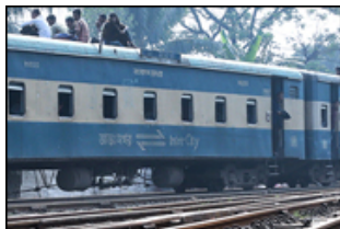
SASEC PROJECTS COMPLETION OF AKHAURA-LAKSAM RAILWAY SECTION TO SAVE TRAVEL TIME