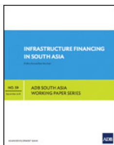
Infrastructure Financing in South Asia