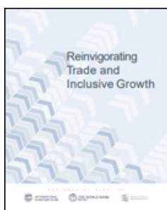
Reinvigorating Trade and Inclusive Growth