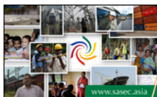
SASEC WEBSITE BROCHURE