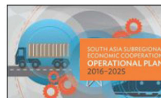
SASEC OPERATIONAL PLAN 2016-2025