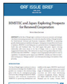
BIMSTEC and Japan: Exploring Prospects for Renewed Cooperation