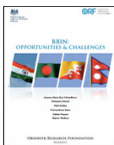
BBIN: Opportunities and Challenges