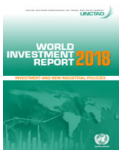
World Investment Report 2018