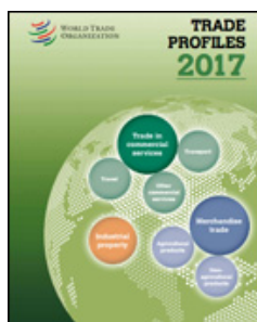
World Trade Organization: Trade Profiles 2017