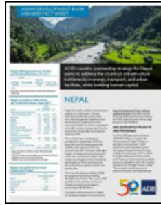
Asian Development Bank and Nepal: Fact Sheet