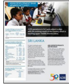
Asian Development Bank and Sri Lanka: Fact Sheet