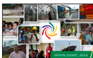
SASEC WEBSITE BROCHURE