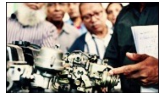
PROJECT DEVELOPMENT PLAN FOR BANGLADESH ECONOMIC CORRIDOR SUBMITTED TO GOVT.