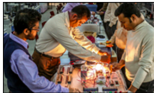
PROJECT NEPAL: REGIONAL URBAN DEVELOPMENT PROJECT