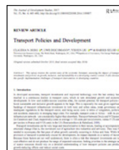
World Bank: Transport Policies and Development