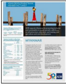
Asian Development Bank and Myanmar: Fact Sheet