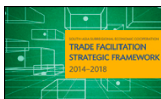
SASEC TRADE FACILITATION STRATEGY