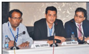
SASEC NEWS INLAND WATERWAYS TO SPUR BBIN DEVELOPMENT