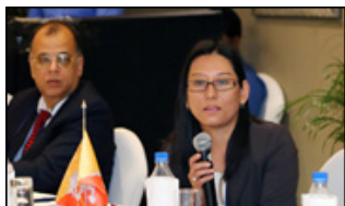
SASEC EVENTS MEETING OF CROSS- BORDER POWER TRADE WORKING GROUP