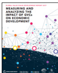
Measuring and Analyzing the Impact of GVCs on Economic Development