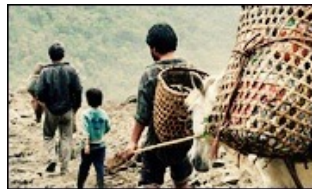
PROJECT WORK STARTS ON PHUENTSHOLING NORTHERN BYPASS