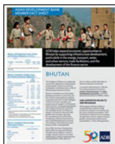
Asian Development Bank and Bhutan: Fact Sheet