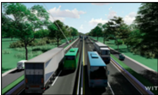
PROJECT ADB TO HELP UPGRADE DHAKA-NORTHWEST INTERNATIONAL TRADE CORRIDOR