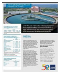
Asian Development Bank and India: Fact Sheet