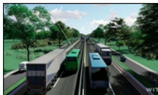
SASEC PROJECTS ADB TO HELP UPGRADE INTERNATIONAL TRADE CORRIDOR