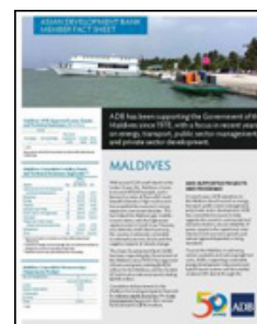
Asian Development Bank and Maldives: Fact Sheet