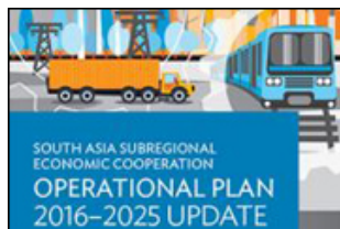
SASEC OPERATIONAL PLAN 2016-2025 UPDATE