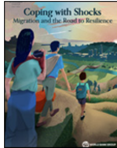
South Asia Economic Focus (Fall 2022) Coping with Shocks: Migration and the Road to Resilience