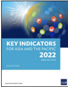
Key Indicators for Asia and the Pacific 2022