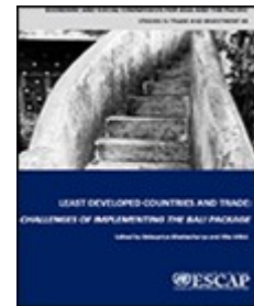
Least Developed Countries and Trade: Challenges of Implementing the Bali Package

See more publications on regional cooperation in South Asia and other regions at http://www.sasec.asia/publications.php