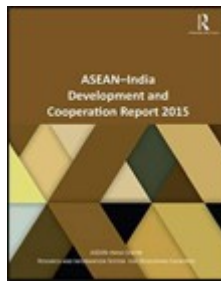
ASEAN-India Development and Cooperation Report 2015