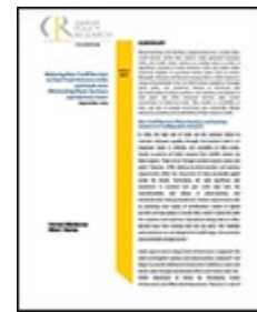
Reducing Non-Tariff Barriers to Food Trade between India And South Asia: Eliminating Phyto-Sanitary and Sanitary Issues