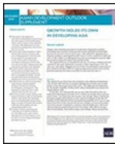
Asian Development Outlook 2015 Supplement: Growth Holds Its Own In Developing Asia