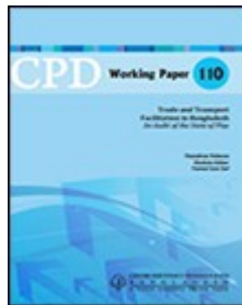
CPD Working Paper 110: Trade and Transport Facilitation In Bangladesh