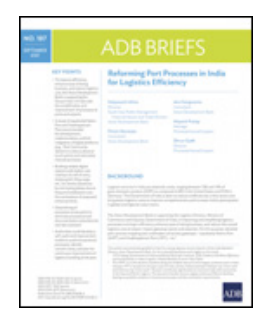
Reforming Port Processes in India for Logistics Efficiency