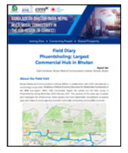
Field Diary Phuentsholing: Largest Commercial Hub in Bhutan