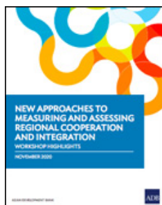
New Approaches to Measuring and Assessing Regional Cooperation and Integration: Workshop Highlights