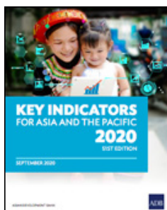
Key Indicators for Asia and the Pacific 2020