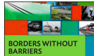
BORDERS WITHOUT BARRIERS: FACILITATING TRADE IN SASEC COUNTRIES