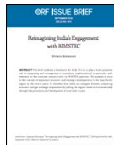
Reimagining India's Engagement with BIMSTEC