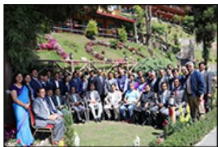
SASEC EVENTS TRAINING ON POST CLEARANCE AUDIT FOR NEPAL CUSTOMS