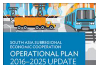
SASEC OPERATIONAL PLAN 2016-2025 UPDATE