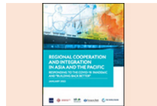
PUBLICATIONS REGIONAL COOPERATION AND INTEGRATION IN ASIA AND THE PACIFIC