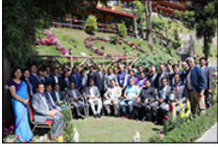
EVENT TRAINING ON POST CLEARANCE AUDIT FOR NEPAL CUSTOMS