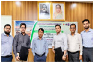
PROJECT SASEC ROAD CONNECTIVITY PROJECT 2