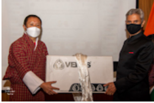
NEWS BHUTAN, INDIA INAUGURATE THREE PROJECTS UNDER INDIAN ASSISTANCE