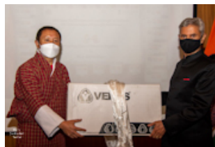
SASEC NEWS BHUTAN, INDIA INAUGURATE THREE PROJECTS UNDER INDIAN ASSISTANCE