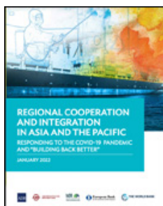
Regional Cooperation and Integration in Asia and the Pacific: Responding to the COVID-19 Pandemic and "Building Back Better"