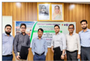
SASEC PROJECTS BANGLADESH SIGNS INTELLIGENT TRANSPORT SYSTEM PROJECT UNDER SASEC