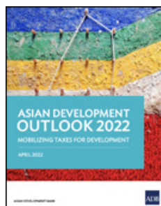
Asian Development Outlook 2022: Mobilizing Taxes for Development