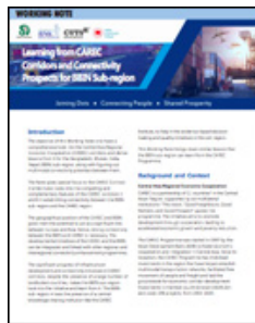
Learning from CAREC Corridors and Connectivity: Prospects for BBIN Sub-region