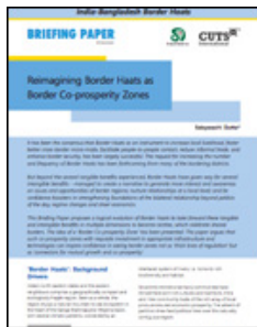
Reimagining Border Haats as Border Co-prosperity Zones