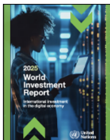
World Investment Report 2025