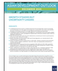
Asian Development Outlook (ADO) December 2025: Growth Steadies But Uncertainty Lingers