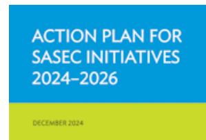
ACTION PLAN OF SASEC INITIATIVES (2024- 2026)