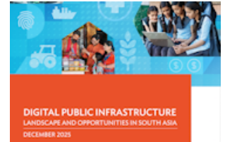
PUBLICATIONS DIGITAL PUBLIC INFRASTRUCTURE LANDSCAPE AND OPPORTUNITIES IN SOUTH ASIA