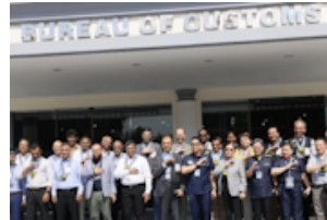
NEWS SASEC CUSTOMS SUBGROUP HOLDS FIELD VISIT TO CLARK FREEPORT ZONE-PHILIPPINES