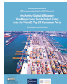
Anchoring Global Efficiency: Visakhapatnam Leads India's Entry into the World's Top 20 Container Ports