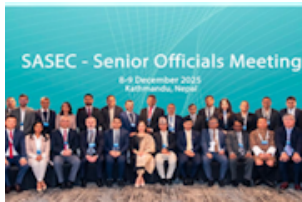
EVENTS SASEC SENIOR OFFICIALS' MEETING