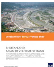
Bhutan and the Asian Development Bank – Integrated Support for Sustainable and Inclusive Growth in Phuentsholing: Development Effectiveness Brief