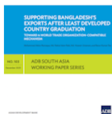
Supporting Bangladesh's Exports After Least Developed Country Graduation: Toward a World Trade Organization- Compatible Mechanism