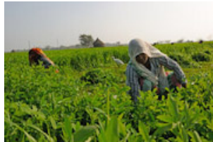
PROJECTS INDIA: INTEGRATED ECOTOURISM AND SUSTAINABLE AGRI-BASED LIVELIHOOD DEVELOPMENT IN MEGHALAYA PROJECT