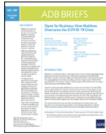
Open for Business: How Maldives Overcame the COVID-19 Crisis