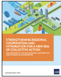
Strengthening Regional Cooperation and Integration for a New Era of Collective Action: Proceedings of the 2022 Regional Cooperation and Integration Conference