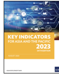
Key Indicators for Asia and the Pacific 2023