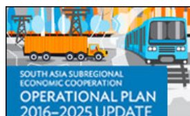
SASEC OPERATIONAL PLAN 2016-2025 UPDATE