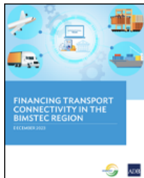
Financing Transport Connectivity in the BIMSTEC Region