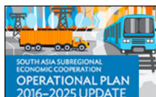
SASEC OPERATIONAL PLAN 2016-2025 UPDATE