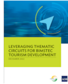
Leveraging Thematic Circuits for BIMSTEC Tourism Development