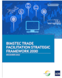
BIMSTEC Trade Facilitation Strategic Framework 2030