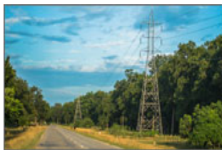
SASEC PROJECTS ADB COUNTRY DIRECTOR VISITS SASEC ROAD PROJECT IN NEPAL