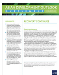
Asian Development Outlook 2021 Supplement: Recovery Continues Fall 2021