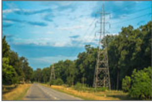
PROJECT ADB COUNTRY DIRECTOR VISITS SASEC ROAD PROJECT IN NEPAL