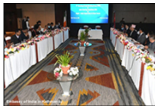
SASEC NEWS INDIA AND NEPAL JOINT WORKING GROUP AND JOINT STEERING COMMITTEE ON ENERGY SECTOR MEET