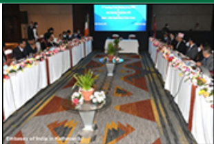
NEWS INDIA AND NEPAL DISCUSS ENERGY SECTOR COOPERATION