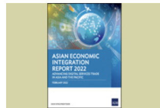
PUBLICATIONS AEIR 2022: ADVANCING DIGITAL SERVICES TRADE IN ASIA AND THE PACIFIC