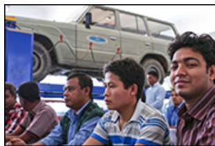
SASEC PROJECTS PROPOSED ADB PROJECT TO ENHANCE BANGLADESH'S LAND PORTS CAN BOOST FOREIGN TRADE