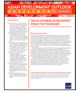
Asian Development Outlook (ADO) 2020 Supplement: Paths Diverge in Recovery from the Pandemic