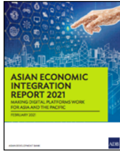
Asian Economic Integration Report 2021: Making Digital Platforms Work for Asia and the Pacific