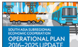
SASEC OPERATIONAL PLAN 2016-2025 UPDATE