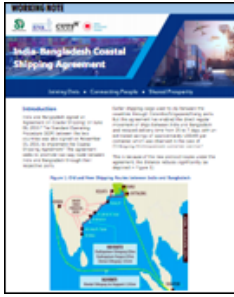
India-Bangladesh Coastal Shipping Agreement