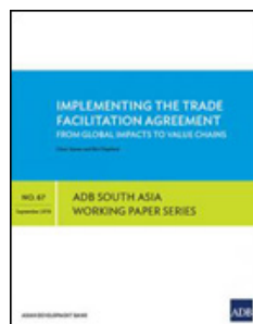
Implementing the Trade Facilitation Agreement: From Global Impacts to Value Chains