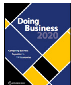
Doing Business 2020