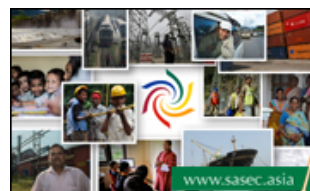
SASEC WEBSITE BROCHURE