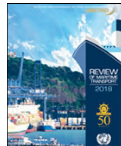
Review of Maritime Transport 2018