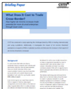
What Does It Cost to Trade Cross-Border?