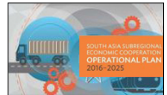
SASEC OPERATIONAL PLAN 2016-2025