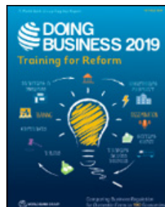
Doing Business 2019: Training for Reform