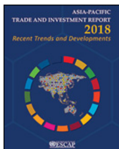
Asia-Pacific Trade and Investment Report 2018: Recent Trends and Developments