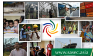
SASEC WEBSITE BROCHURE