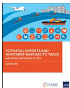
Potential Exports and Nontariff Barriers to Trade: Maldives National Study