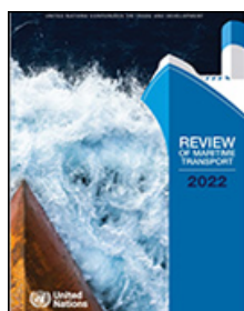
Review of Maritime Transport 2022