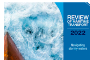
PUBLICATIONS REVIEW OF MARITIME TRANSPORT 2022