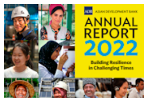
PUBLICATIONS ADB ANNUAL REPORT 2022