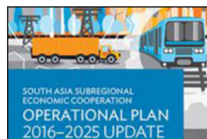
SASEC OPERATIONAL PLAN 2016-2025 UPDATE