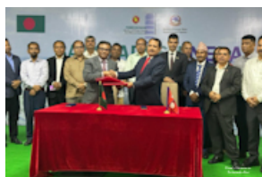
SASEC NEWS BANGLADESH, NEPAL JSC MEETING ON ENERGY COOPERATION DISCUSS FAST- TRACKING EXPORT OF POWER VIA INDIA