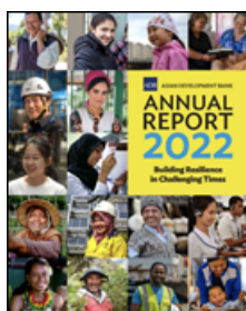
ADB Annual Report 2022