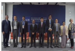
SASEC NEWS ADB VP (OPERATIONS 1) HIGHLIGHTS ROLE OF SASEC