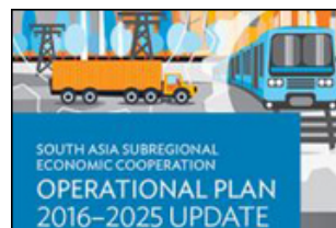
SASEC OPERATIONAL PLAN 2016-2025 UPDATE