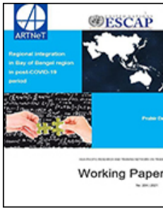
Regional Integration in Bay of Bengal Region in Post-COVID-19 Period