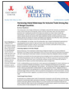
Harnessing Inland Waterways for Inclusive Trade Among Bay of Bengal Countries