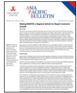
Making BIMSTEC a Regional Vehicle for Nepal's Economic Growth