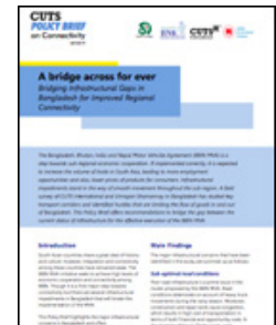
A Bridge Across for Ever: Bridging Infrastructural Gaps in Bangladesh for Improved Regional Connectivity