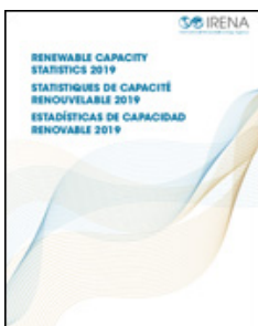
Renewable Capacity Statistics 2019