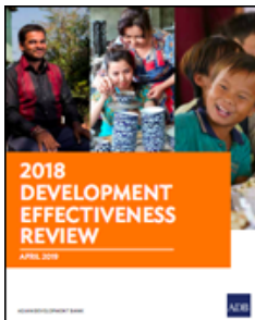
2018 Development Effectiveness Review