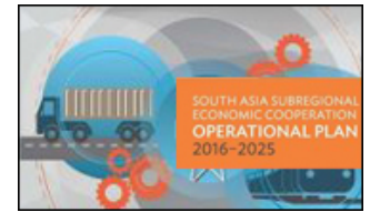
SASEC OPERATIONAL PLAN 2016-2025