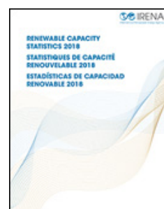
Renewable Capacity Statistics 2018