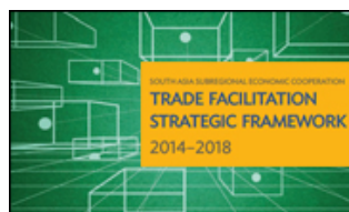
SASEC TRADE FACILITATION STRATEGY