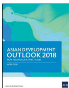
Asian Development Outlook (ADO) 2018: How Technology Affects Jobs