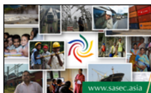
SASEC WEBSITE BROCHURE