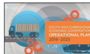
SASEC OPERATIONAL PLAN 2016-2025