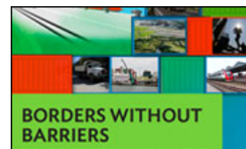
BORDERS WITHOUT BARRIERS: FACILITATING TRADE IN SASEC COUNTRIES