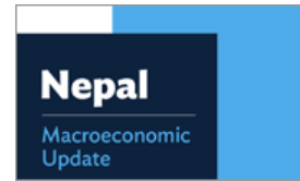
PUBLICATIONS MACROECONOMIC UPDATE: NEPAL (SEPTEMBER 2024)