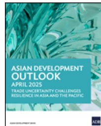
Asian Development Outlook (ADO) April 2025