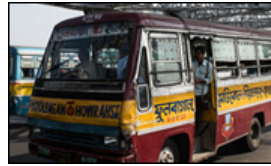
NEWS BBIN READY MOTOR VEHICLES AGREEMENT PROTOCOL