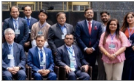
EVENTS WORKSHOP ON BBIN RAIL-BASED CARGO MOVEMENT STUDY