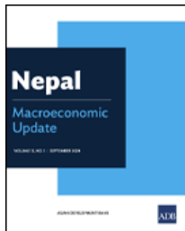
Macroeconomic Update: Nepal (September 2024)