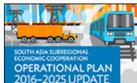
SASEC OPERATIONAL PLAN 2016-2025 UPDATE