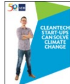
Cleantech Start-ups Can Solve Climate Change

See more publications on regional cooperation in South Asia and other regions at http://www.sasec.asia/publications.php