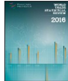
World Trade Statistical Review 2016