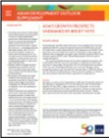
Asian Development Outlook 2016 Supplement