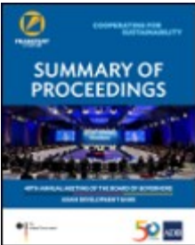
49th Annual Meeting of the Board of Governors: Summary of Proceedings