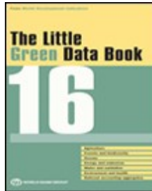
The Little Green Data Book 2016