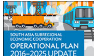
SASEC OPERATIONAL PLAN 2016-2025 UPDATE