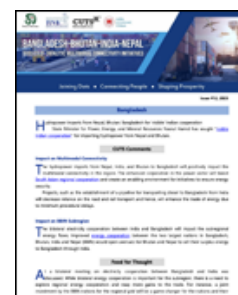
Dossier of Catalytic Multi-modal Connectivity Initiatives in the BBIN Sub-region