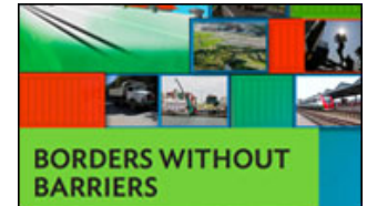
BORDERS WITHOUT BARRIERS: FACILITATING TRADE IN SASEC COUNTRIES