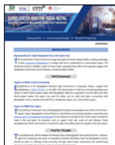
Quarterly Dossier: Catalytic Multimodal Connectivity Initiatives in the BBIN Sub-region