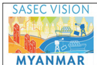
SASEC VISION MYANMAR