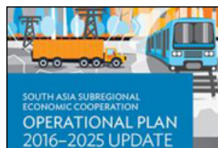
SASEC OPERATIONAL PLAN 2016-2025 UPDATE