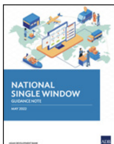
National Single Window: Guidance Note