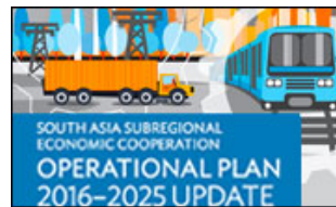
SASEC OPERATIONAL PLAN 2016-2025 UPDATE