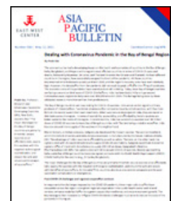
Dealing with Coronavirus Pandemic in the Bay of Bengal Region