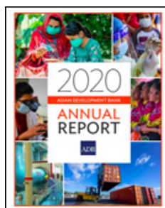
ADB Annual Report 2020