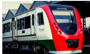
SASEC PROJECTS BANGLADESH TRANSPORT DEAL INKED