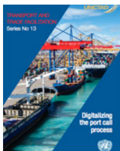
Digitalizing the Port Call Process