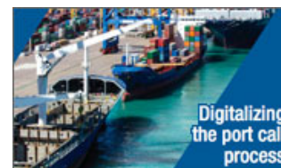
PUBLICATIONS DIGITALIZING THE PORT CALL PROCESS