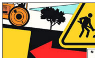
SASEC NEWS CONNECTIVITY TO HELP BBIN FACE POST-COVID SHOCKS