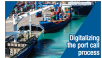
PUBLICATIONS DIGITALIZING THE PORT CALL PROCESS