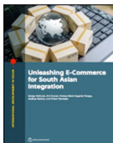
Unleashing E-Commerce for South Asian Integration