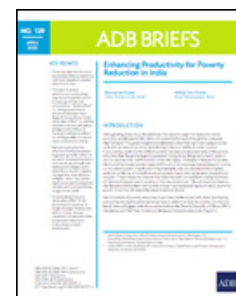
Enhancing Productivity for Poverty Reduction in India