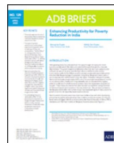
Enhancing Productivity for Poverty Reduction in India