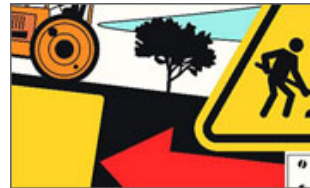
SASEC NEWS CONNECTIVITY TO HELP BBIN FACE POST-COVID SHOCKS