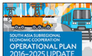
SASEC OPERATIONAL PLAN 2016-2025 UPDATE