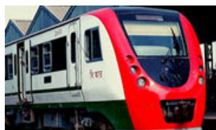
SASEC PROJECTS BANGLADESH TRANSPORT DEAL INKED