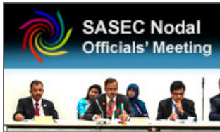
SASEC EVENTS SASEC NODAL OFFICIALS' MEETING