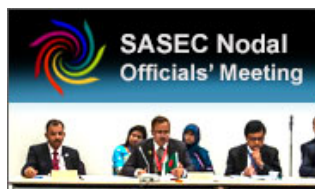
SASEC EVENTS SASEC NODAL OFFICIALS' MEETING