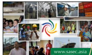
SASEC WEBSITE BROCHURE