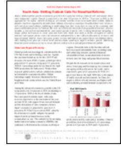
South Asia: Shifting Outlook Calls for Steadfast Reforms