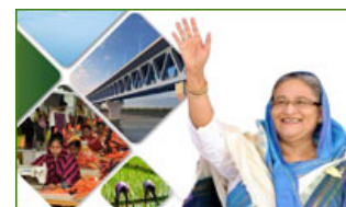
PUBLICATIONS BOUNTIFUL BANGLADESH