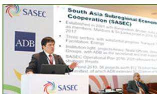
SASEC EVENTS CONFERENCE ON SAFE MOBILITY & REGIONAL CONNECTIVITY