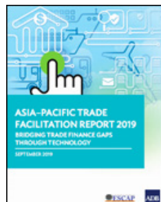
Asia-Pacific Trade Facilitation Report 2019: Bridging Trade Finance Gaps through Technology