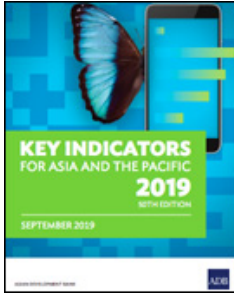
Key Indicators for Asia and the Pacific 2019