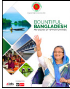
Bountiful Bangladesh: An Ocean of Opportunities