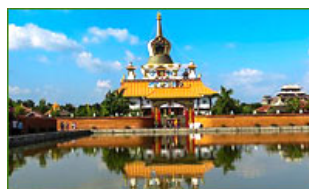
SASEC NEWS NEPAL AIRPORT DEVELOPMENT TO BENEFIT THE REGION