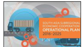
SASEC OPERATIONAL PLAN 2016-2025