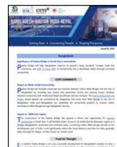
Significance of Padma Bridge in South Asia's Connectivity