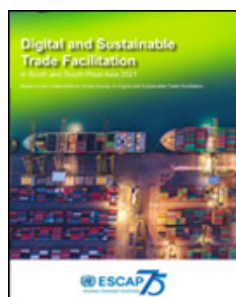
Digital and Sustainable Trade Facilitation in South and South-West Asia 2021