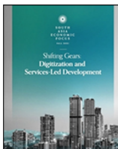
South Asia Economic Focus Fall 2021