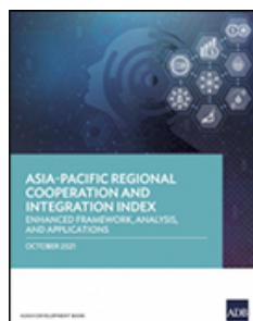
Asia-Pacific Regional Cooperation and Integration Index: Enhanced Framework, Analysis, and Applications