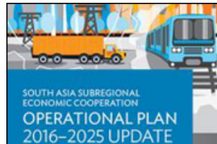
SASEC OPERATIONAL PLAN 2016-2025 UPDATE