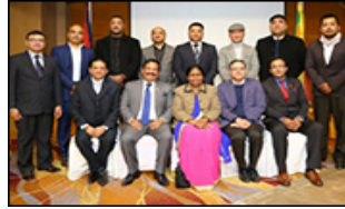
NEWS SRI LANKA PROMOTES ECONOMIC RELATIONS WITH NEPAL