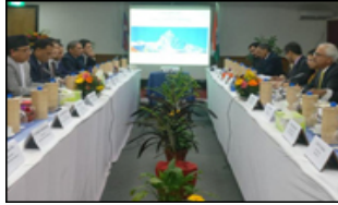
NEWS INDIA, NEPAL AGREE TO SET UP ENERGY BANK