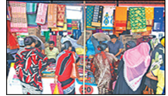
NEWS COMMENTARY: SMART BORDERS TO BOOST TRADE IN SOUTH ASIA