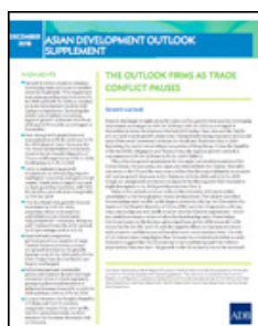
Asian Development Outlook 2018 Supplement: The Outlook Firms as Trade Conflict Pauses