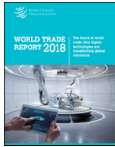
World Trade Report 2018: The Future of World Trade