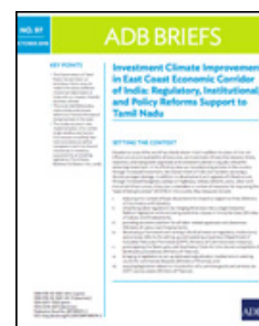
Investment Climate Improvement in East Coast Economic Corridor of India: Regulatory, Institutional, and Policy Reforms Support to Tamil Nadu