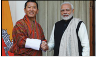
NEWS BHUTAN PRIME MINISTER LOTAY TSHERING UNDERTOOK MAIDEN VISIT TO INDIA