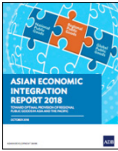
Asian Economic Integration Report 2018