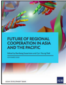
Future of Regional Cooperation in Asia and the Pacific