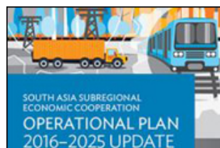
SASEC OPERATIONAL PLAN 2016-2025 UPDATE