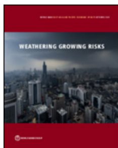
World Bank East Asia and Pacific Economic Update, October 2019: Weathering Growing Risks