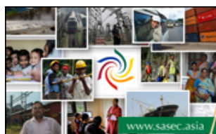
SASEC WEBSITE BROCHURE