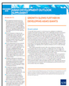
Asian Development Outlook (ADO) 2019 Supplement, December: Growth Slows Further in Developing Asia's Giants