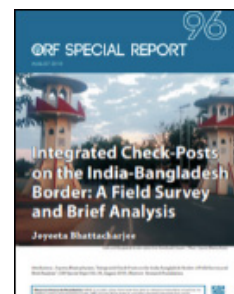
Integrated Check-Posts on the India- Bangladesh Border: a Field Survey and Brief Analysis