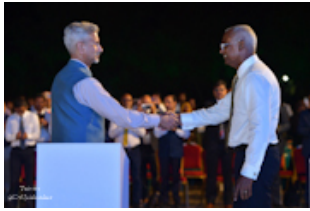
SASEC NEWS MALDIVES, INDIA LAUNCH HANIMAADHOO INTERNATIONAL AIRPORT PROJECT