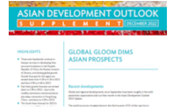
PUBLICATIONS ASIAN DEVELOPMENT OUTLOOK 2022 SUPPLEMENT