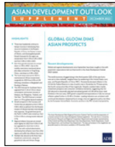
Asian Development Outlook 2022 Supplement: Global Gloom Dims Asian Prospects