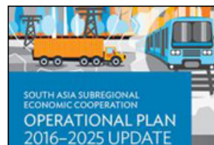
SASEC OPERATIONAL PLAN 2016–2025 UPDATE