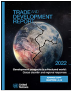
Trade and Development Report 2022