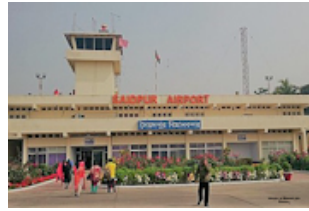
SASEC NEWS BANGLADESH TO UPGRADE THE SAIDPUR AIRPORT TO BOOST CONNECTIVITY WITH BIN NEIGHBORS