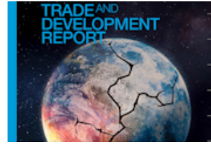
PUBLICATIONS TRADE AND DEVELOPMENT REPORT 2022