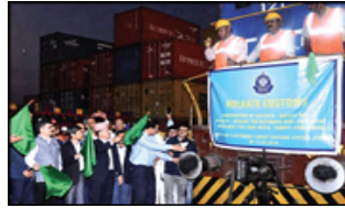
SASEC PROJECTS ECTS TO BE IMPLEMENTED ON NEPAL-BOUND CARGO