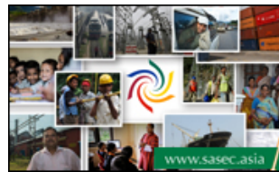
SASEC WEBSITE BROCHURE