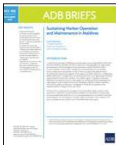
Sustaining Harbor Operation and Maintenance in Maldives