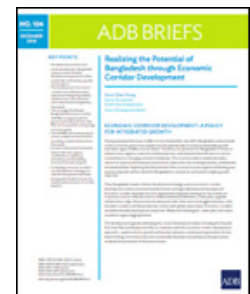
Realizing the Potential of Bangladesh through Economic Corridor Development