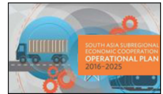
SASEC OPERATIONAL PLAN 2016-2025