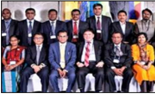
SASEC EVENTS WORKSHOP ON MARITIME COOPERATION IN SASEC