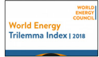
PUBLICATIONS WORLD ENERGY TRILEMMA INDEX 2018