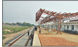
SASEC NEWS JAYANAGAR-JANAKPUR RAIL SERVICE IN FINAL STAGE OF COMPLETION