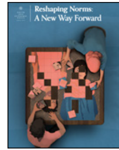
Reshaping Norms: A New Way Forward