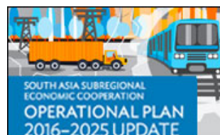
SASEC OPERATIONAL PLAN 2016-2025 UPDATE