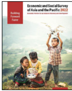
Economic and Social Survey of Asia and the Pacific 2022: Economic Policies for an Inclusive Recovery and Development