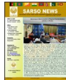
SARSO News: Volume 2, Issue 2