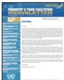
UNCTAD Transport and Trade Facilitation Newsletter No. 66 – Second Quarter 2015