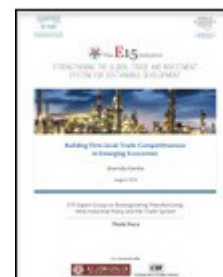
Building Firm-level Trade Competitiveness in Emerging Economies