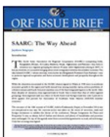
SAARC: The Way Ahead