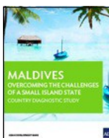
Maldives: Overcoming the Challenges of a Small Island State – Country Diagnostic Study