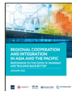
Regional Cooperation and Integration in Asia and the Pacific: Responding to the COVID-19 Pandemic and "Building Back Better"