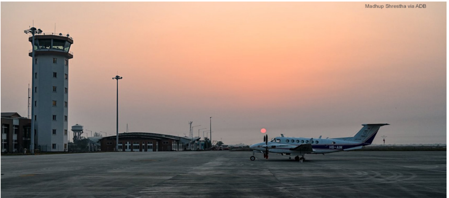
Madhup Shrestha via ADB