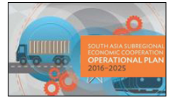
SASEC OPERATIONAL PLAN 2016-2025