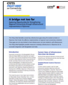
A Bridge Not Too Far: Exploring Opportunities for Strengthening Regional Connectivity through Infrastructural Improvements in Myanmar