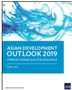
Asian Development Outlook (ADO) 2019: Strengthening Disaster Resilience