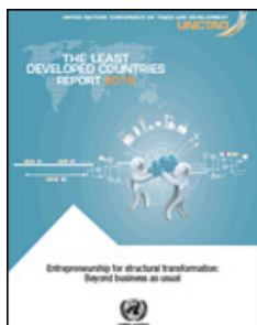
The Least Developed Countries Report 2018