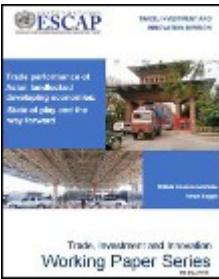
Trade Performance of Asian Landlocked Developing Economies: State of Play and the Way Forward