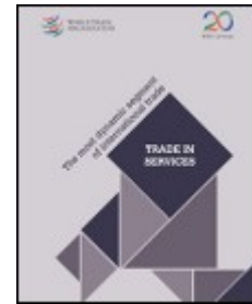
Trade in Services: The Most Dynamic Segment of International Trade

See more publications on regional cooperation in South Asia and other regions at http://www.sasec.asia/publications.php