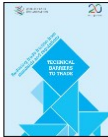
Technical Barriers to Trade: Reducing Trade Friction from Standards and Regulations