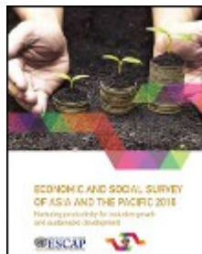
Economic and Social Survey of Asia And the Pacific 2016