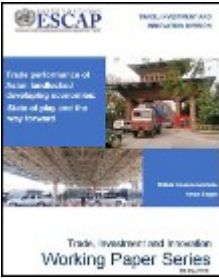
Trade Performance of Asian Landlocked Developing Economies: State of Play and the Way Forward