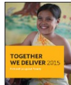
Together We Deliver 2015: Partnerships against Poverty