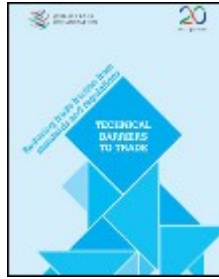
Technical Barriers to Trade: Reducing Trade Friction from Standards and Regulations