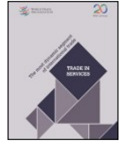
Trade in Services: The Most Dynamic Segment of International Trade

See more publications on regional cooperation in South Asia and other regions at http://www.sasec.asia/publications.php