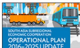
SASEC OPERATIONAL PLAN 2016-2025 UPDATE