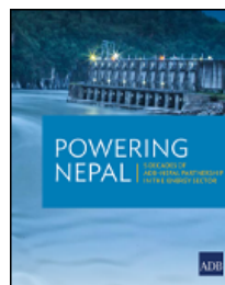
Powering Nepal: 5 Decades of ADB–Nepal Partnership in the Energy Sector