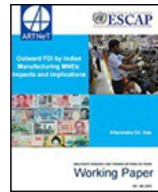
Outward FDI by Indian Manufacturing MNEs: Impacts and Implications