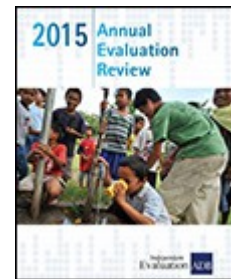
2015 Annual Evaluation Review

See more publications on regional cooperation in South Asia and other regions at http://www.sasec.asia/publications.php