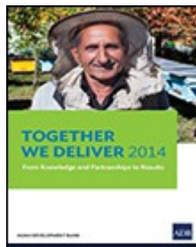
Together We Deliver 2014: From Knowledge and Partnerships to Results