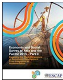
Economic and Social Survey for Asia and the Pacific: Part 2 – Balancing the Three Dimensions of Sustainable Development