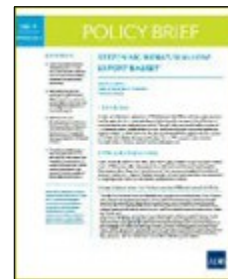
Deepening India's Shallow Export Basket

See more publications on regional cooperation in South Asia and other regions at http://sasec.asia/publications.php