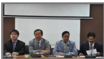
Technical Assistance Report Japan Fund for Poverty Reduction The Himalayan Times New Spotlight Nepal