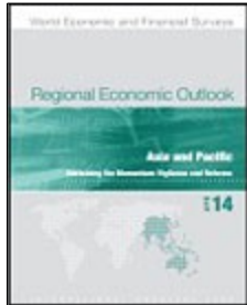
Regional Economic Outlook: Asia and Pacific - Sustaining the Momentum: Vigilance and Reforms