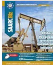
SAARC Biz: The Inevitability of South Asia