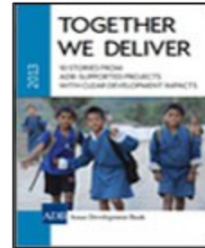
Together We Deliver: 10 Stories from ADB-Supported Projects