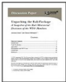
Unpacking the Bali Package: A Snapshot of Bali Ministerial Decisions of WTO Members