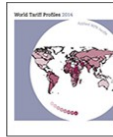
World Tariff Profiles 2014