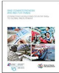
SME Competitiveness and Aid for Trade: Connecting Developing Country SMEs to Global Value Chains