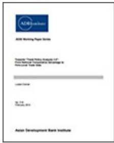
Towards Trade Policy Analysis 2.0: From National Comparative Advantage to Firm-Level Trade Data