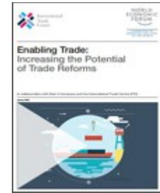
Enabling Trade: Increasing the Potential of Trade Reforms

See more publications on regional cooperation in South Asia and other regions at http://www.sasec.asia/publications.php