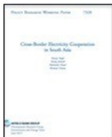
Cross-Border Electricity Cooperation in South Asia