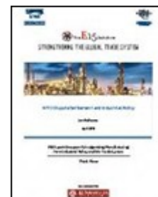
WTO Dispute Settlement and Industrial Policy

See more publications on regional cooperation in South Asia and other regions at http://www.sasec.asia/publications.php